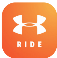
Map my Ride