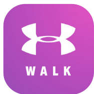
Map my Walk